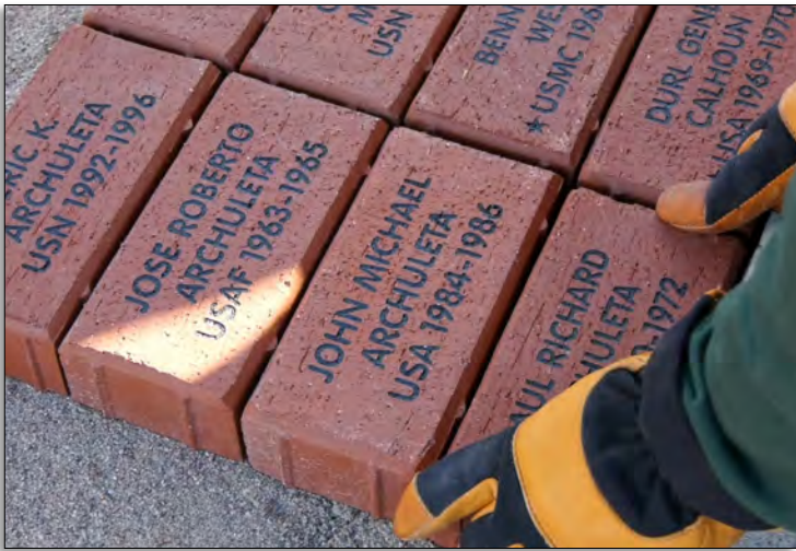
Photos are from previous bricklaying events