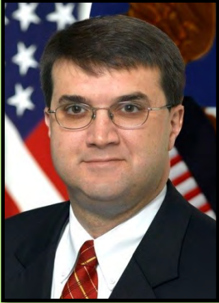
VA Secretary Robert Wilkie

For more news and benefits information from the VA, visit www.va.gov