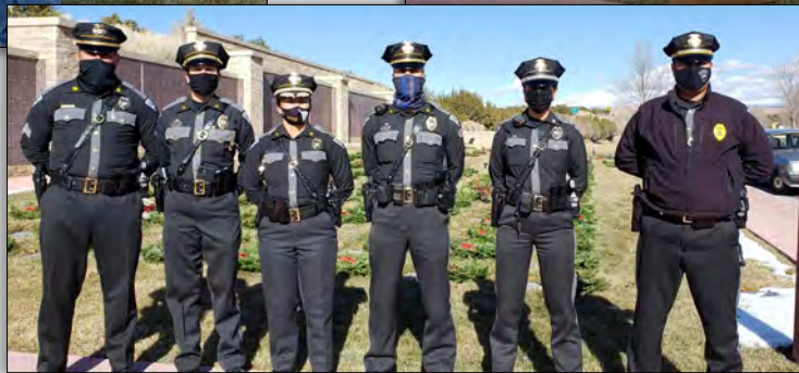
New Mexico State Police