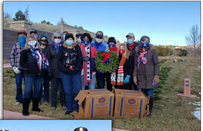
Blue Star Mothers of Northern NM