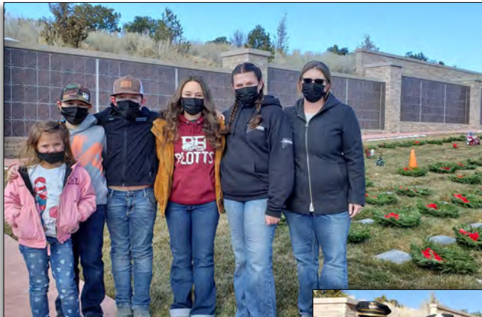
“Bandits” 4-H Club

“Today, through this ‘virtual’ gathering, we will still remember that Americans are able to celebrate the holiday season...to spend time with family and loved ones...because of the service and sacrifice of the men and women who have served in the United States Armed Forces.”