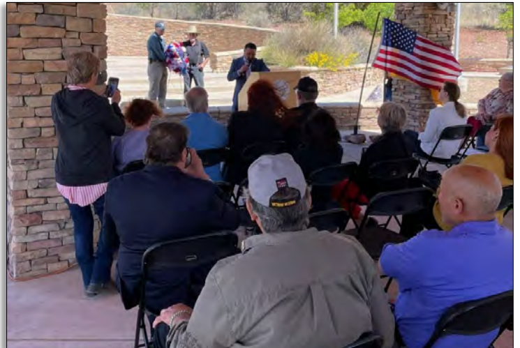
Boy Scouts Troop 640 presented the Colors for the singing of the National Anthem and the Pledge of Allegiance at the Sunday, May 29 Memorial Day Ceremony in the Village of Tijeras.