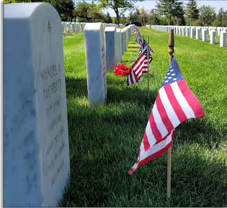
TOP LEFT & RIGHT PHOTOS: Flags were placed by volunteers and cemetery staff at many of the cemetery's gravesites.