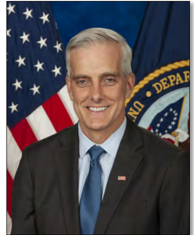
Denis McDonough Secretary, U.S. Dept. of Veterans Affairs

Secretary McDonough is also scheduled to meet staff and tour the Raymond G. Murphy VA Medical Center in Albuquerque. Based on recommendations to the AIR Commission, PTSD treatment provided in Albuquerque may also be moved to a facility in the Phoenix, Arizona metro area.