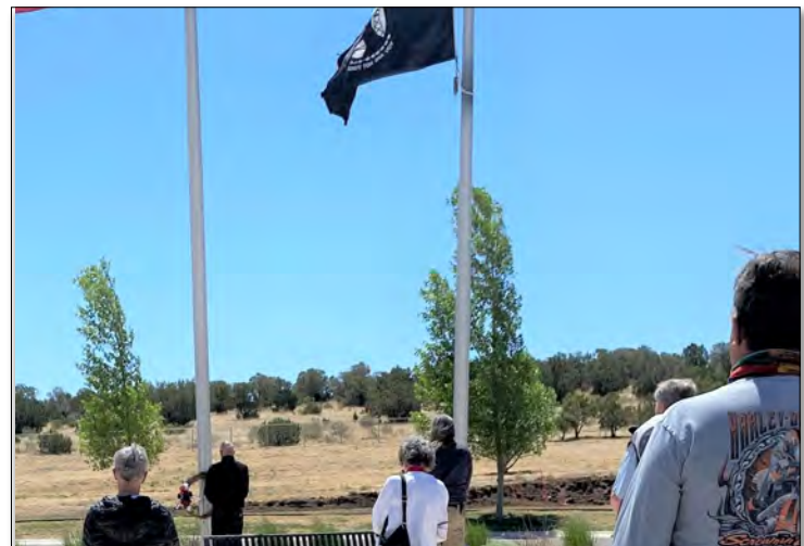
LEFT PHOTO: Large roadside and smaller headstone American flags were placed at the Fort Stanton State Veterans Cemetery by cemetery staff and volunteers.