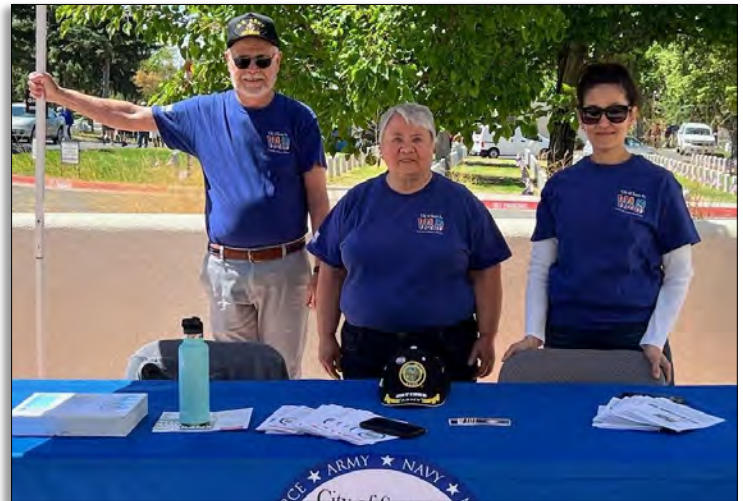
At the Santa Fe National Cemetery, among the large crowd attending the city’s annual Memorial Day Ceremony were: