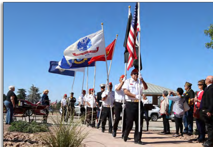
Flags were placed on the gravesites at the Fort Bayard National Cemetery in advance of the Memorial Day ceremony. Members of the Marine Corps League Gaffney-Oglesby Detachment 1328 posted the colors at the May 30 ceremony.