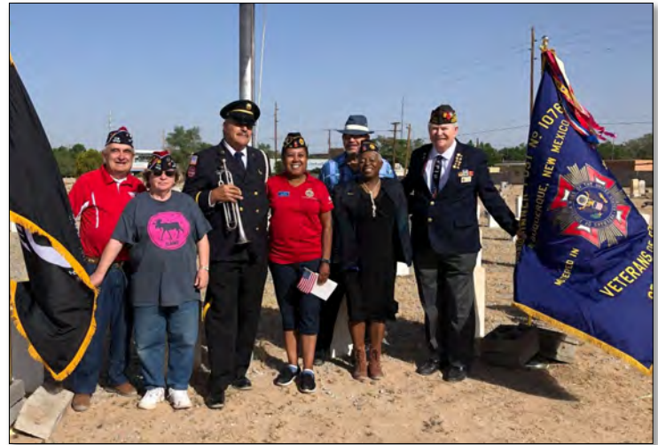
Also in Albuquerque, there was a ceremony at the Historic Fairview Cemetery. More than 500 veterans are believed to be buried here. The cemetery was the city's first public cemetery when it opened in the late-1880s. More than 500 veterans are believed to be buried here—many in unmarked or undecipherable gravesites.