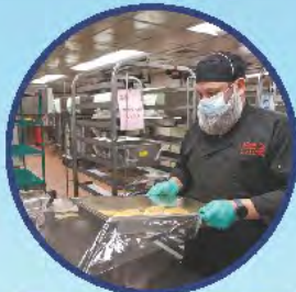
FOOD SERVICE WORKER