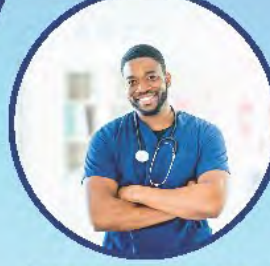
LICENSED PRACTICAL NURSE