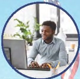
ADV MEDICAL SUPPORT ASSISTANT