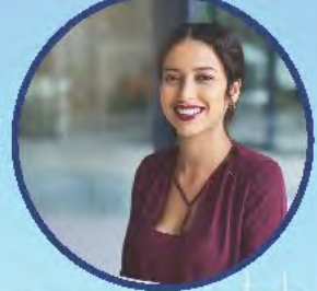
MEDICAL SUPPORT ASSISTANT