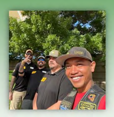
SUPPORT GROUP & SOCIAL HOUR

MONDAYS, 2-3PM FRIENDS AND FAMILY WELCOME