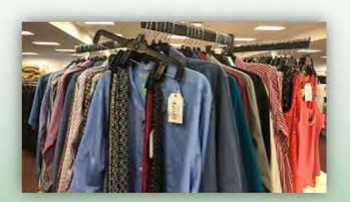
CLOTHING CLOSET FREE CLOTHING FOR VETERANS

DAV DEPARTMENT OF NEW MEXICO 2511 UTAH STREET NE ALBUQUERQUE, NM 87110