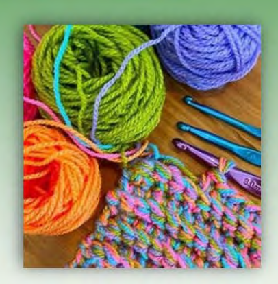
CROCHET & TEA

TUESDAYS, 1:30-3:00PM FRIENDS AND FAMILY WELCOME