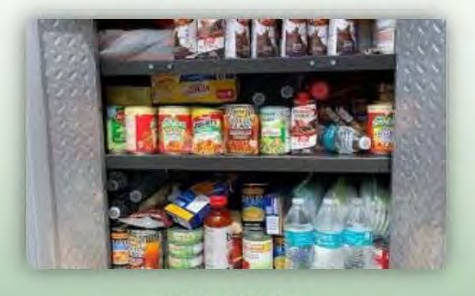
FOOD PANTRY FREE FOOD FOR VETERANS

DAV DEPARTMENT OF NEW MEXICO 2511 UTAH STREET NE ALBUQUERQUE, NM 87110