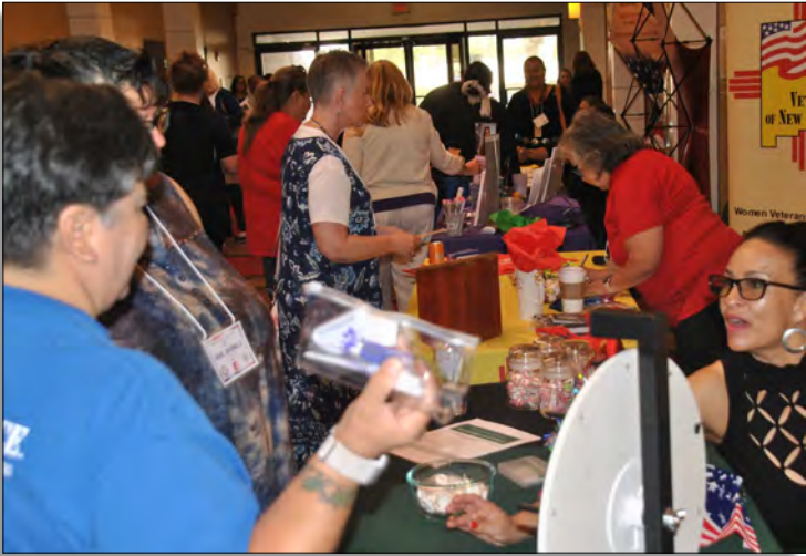
Attendees were also encouraged to gather information from 20 tables in the lobby that were staffed by federal and state veterans' and community service agencies.

Also attending the conference were State Senator Shannon Pinto (D-McKinley & San Juan), and State Rep. Debra Sariñana (D-Bernalillo). Conference attendees were also able to stop by more than two dozen informational tables before the conference and during breaks.