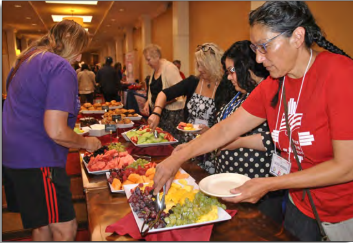
A continental breakfast (pictured, during check-in) and a plated enchilada lunch were provided by the hotel.

Representatives from the New Mexico VA Health Care System talked about a $1.5 million VA grant which will greatly expand its women veterans' program, other patient services, and LGBTQ+ care and support.