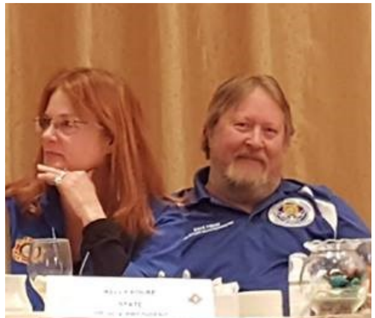
Mid-Winter Conference 2018

Yes, a bit serious, however, sometimes it is all about taking care of business.